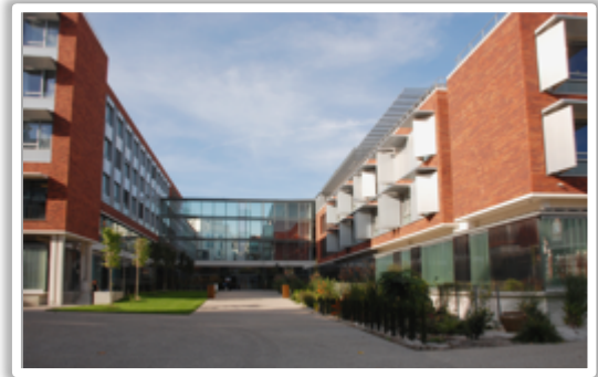
Rothschild Hospital (AP-HP), 5 rue Santerre 75012 Paris

Each student is involved in one or more research projects in the fields of clinical, basic, or translational research in periodontology and implant dentistry. Most of the students complete the program with one or more publications in international peer-reviewed journals.