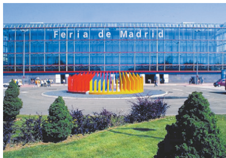
Centro de Convenciones IFEMA, Madrid

The organisation of EuroPerio 5 is running smoothly. These are the main highlights: The Europerio 5 web page is already operational. I invite you to visit it at http://www.eurperio5.net . Please put it on your favourites. There you will find all the relevant information on the congress, from hotel booking, registration, abstract